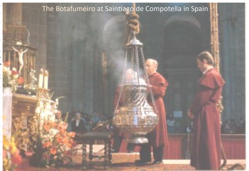
The Botafumeiro at Santiago de Compostella in Spain

Incense is a sacramental, used to sanctify, bless, and venerate. The smoke from the incense is symbolic of the mystery of God Himself. As it rises upward the imagery and smell convey the sweetness of Our Lord's presence and it reinforces how the Mass is linked to Heaven and Earth, ending in the very presence of God.