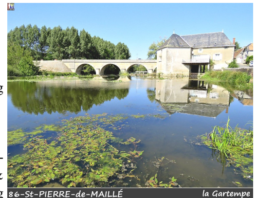
86-St-PIERRE-de-MAILLÉ la Gartempe

The building is a 200 year old convent, founded by local saints St André Hubert and St Jeanne-Elisabeth Bichier, whose shrine is in the neighboring village.